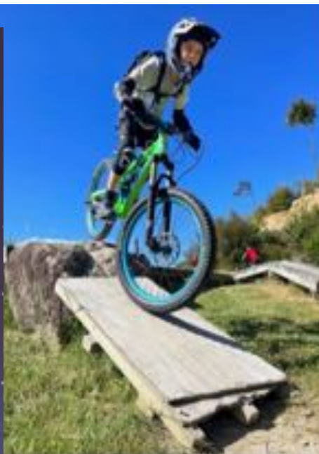
Krankin' Kids mountain bike coaching for youth